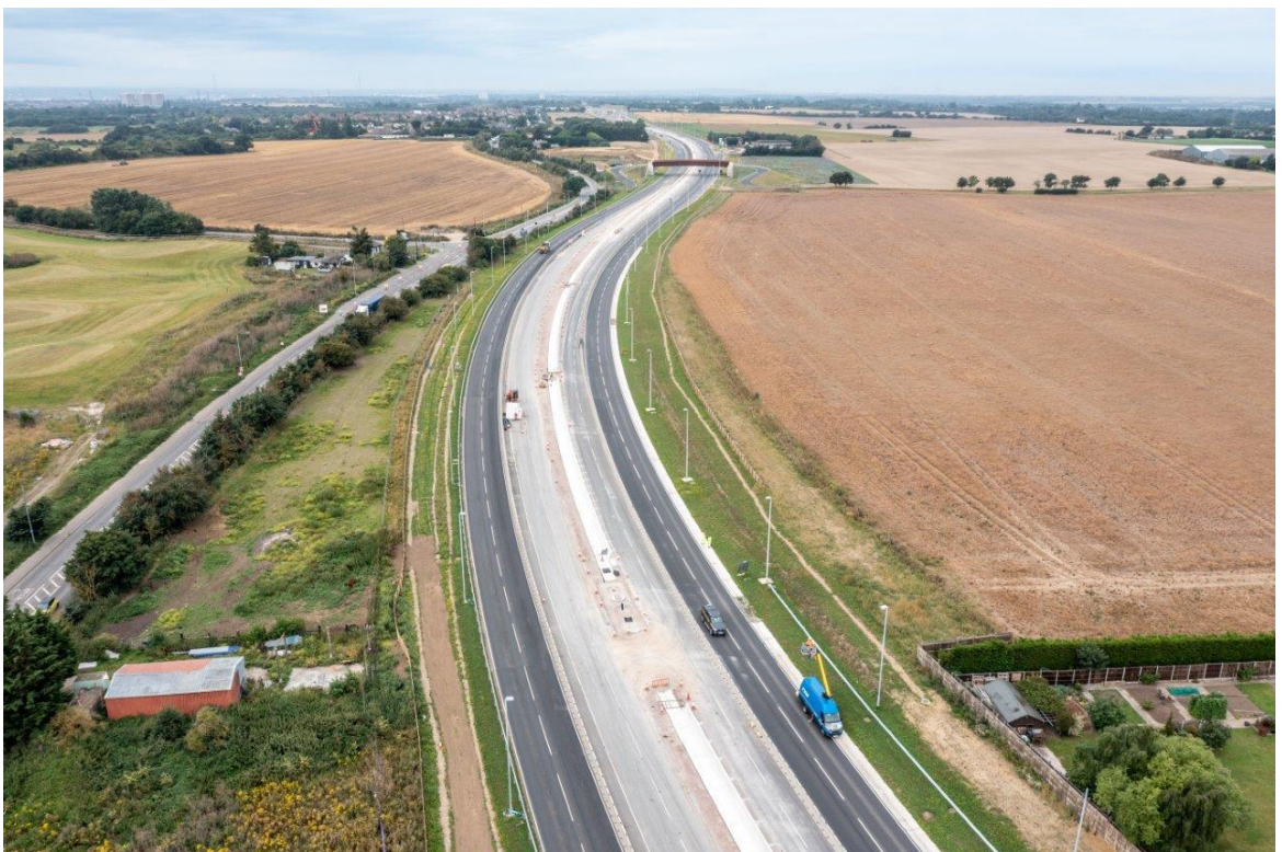
Main Carriageway Looking West From Horndon